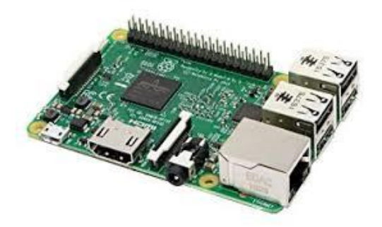
Fig.3. A Raspberry Pi

LEDs, switches, analog signals and other devices. In our proposed design, the GPIO pins are connected to the ultrasonic sensor, image sensor, GPS sensor and the weather sensor. It requires a power source of 5V to be operational and a Micro SD memory card is inserted, which acts as its permanent memory. For our design Raspberry Pi 1 Model B+ is used. It contains 4 USB ports, a HDMI port, an audio jack port and an Ethernet port. The Ethernet port helps the device connect to the Internet and install required driver APIs. It has a 700 MHz single core processor and supports programming languages such as Python, Java, C, and C++ [6].